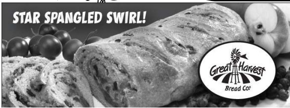
STAR SPANGLED SWIRL!

3900 Medina Road, Fairlawn, Ohio 44333 (330) 666-7497 greatharvestfairlawn.com